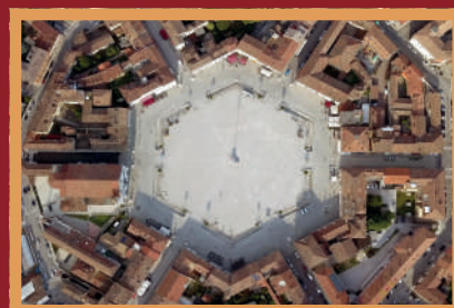
Piazza Grande vista dall'alto