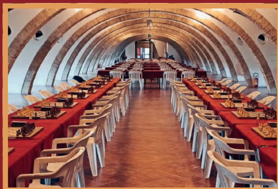
Sede di gioco, Ex Caserma Napoleonica Montesanto